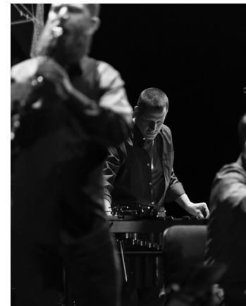
Performance view, eighth blackbird: Hand Eye , MCA Chicago, January 2016

eighth blackbird's members hail from the Great Lakes, Keystone, Golden, Empire, and Bay states. The ensemble's name derives from the eighth stanza of Wallace Stevens's evocative, aphoristic poem, "Thirteen Ways of Looking at a Blackbird" (1917). eighth blackbird is managed by David Lieberman Artists. For more information, please visit eighthblackbird.org .