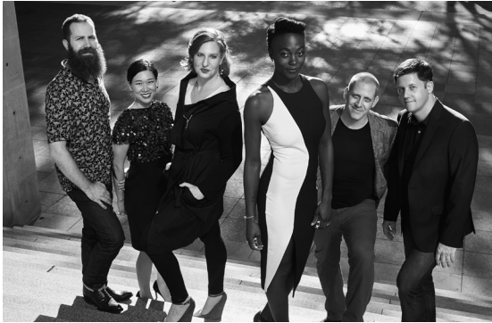
eighth blackbird

eighth blackbird ensemble members are the 2015–16 artists in residence at the MCA. For the first time, the sextet brings its private rehearsal work into the public areas of the museum, preparing new compositions in the galleries. The residency also offers illuminating open rehearsals, an interactive gallery installation, performances, and public talks.